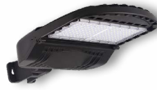
LED Area Light