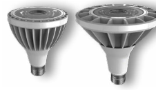
PAR High Lumen