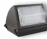
Traditional Wall Pack