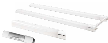
T5 & T8 Linear