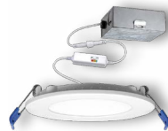
4 & 6 in. Slim Downlight